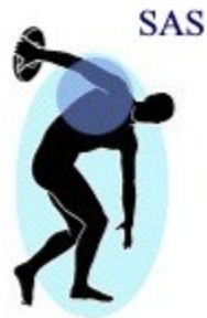
Shoulder Arthroscopic Surgery